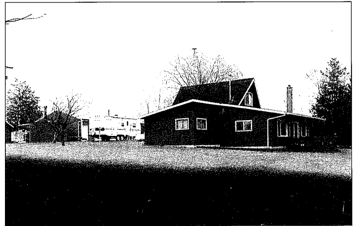
Figure 4. Wildfires cannot burn where there is no fuel.

The amount of radiant heat a wildfire can transfer to your home depends on how far the fire is from the structure and how long it stays there. Research has shown that it is impossible for the radiant heat from a wildland fire to ignite a typical wood-sided home from more than 100 feet away. In fact, in simulations with actual fires and in case studies, homes as close as 33 feet from a wildfire have survived if the flames cannot actually touch the structure (Figure 4).