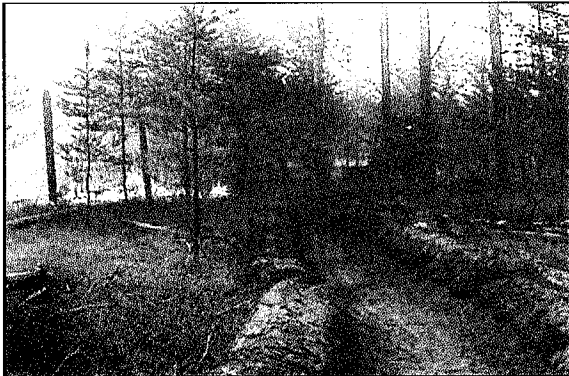
Figure 3. Creating a fuelbreak.

Large wildfires can move rapidly across the landscape, though not like a tidal wave, as is often depicted in the media. A wildfire moves from point to point across the ground as its requirements for heat and fuel are met. If an area contains no fuel, the fire will not go there. This is why wildland firefighters typically control wildfires by removing all vegetation (fuel) down to mineral soil to create a fuelbreak (Figure 3).