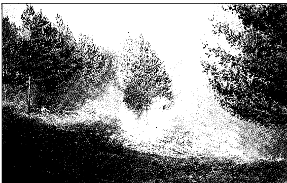
Figure 1. Most wildfires are smaller fires that do not make the evening news.

Typically we think of states such as Colorado, Arizona and California as being prone to wildfires. But Michigan experiences an average of 8,000 to 10,000 wildfires each year. Most of these are small fires that do not make the evening news (Figure 1). But even these small fires can damage or destroy homes and property. Approximately 100 homes are lost or damaged each year by wildfires in Michigan. Wildfires occur in every county of the state. According to the Michigan Department of Natural Resources (MDNR), between 1950 and 1996, the MDNR and the U.S. Forest Service were involved in suppressing 46,100 wildfires that burned 390,000 acres of forest (Michigan State Police Emergency Management Division, 2001).