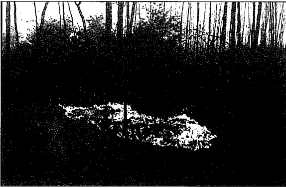
Figure 5. Firebrands can start new fires.

It's firebrands that pose the greatest danger to homes — far more than the flames themselves. These wind-driven embers can be blown under decks and porches, into cracks in the foundation, and into attics through faulty eave and roof vents. They can also land in combustible vegetation adjacent to the home and ignite it, and these flames then can ignite the home. This makes the area within 3 feet of the home the most important. Firebrands can land here and ignite a new fire at the home's most vulnerable point.