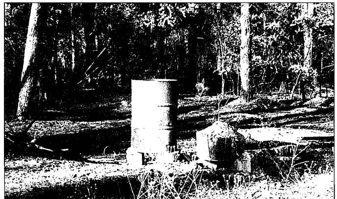
Figure 2. One-third of Michigan wildfires are caused by debris burning.

Wildfires can start in many ways, but about 98 percent of fires are caused by human activities. One-third of all wildfires are caused by people burning debris (household and yard waste, Figure 2). A moment's inattention or an unexpected change in the weather can rapidly turn a debris fire into a wildfire. Once a wildfire starts, it may be impossible for a homeowner to put out.